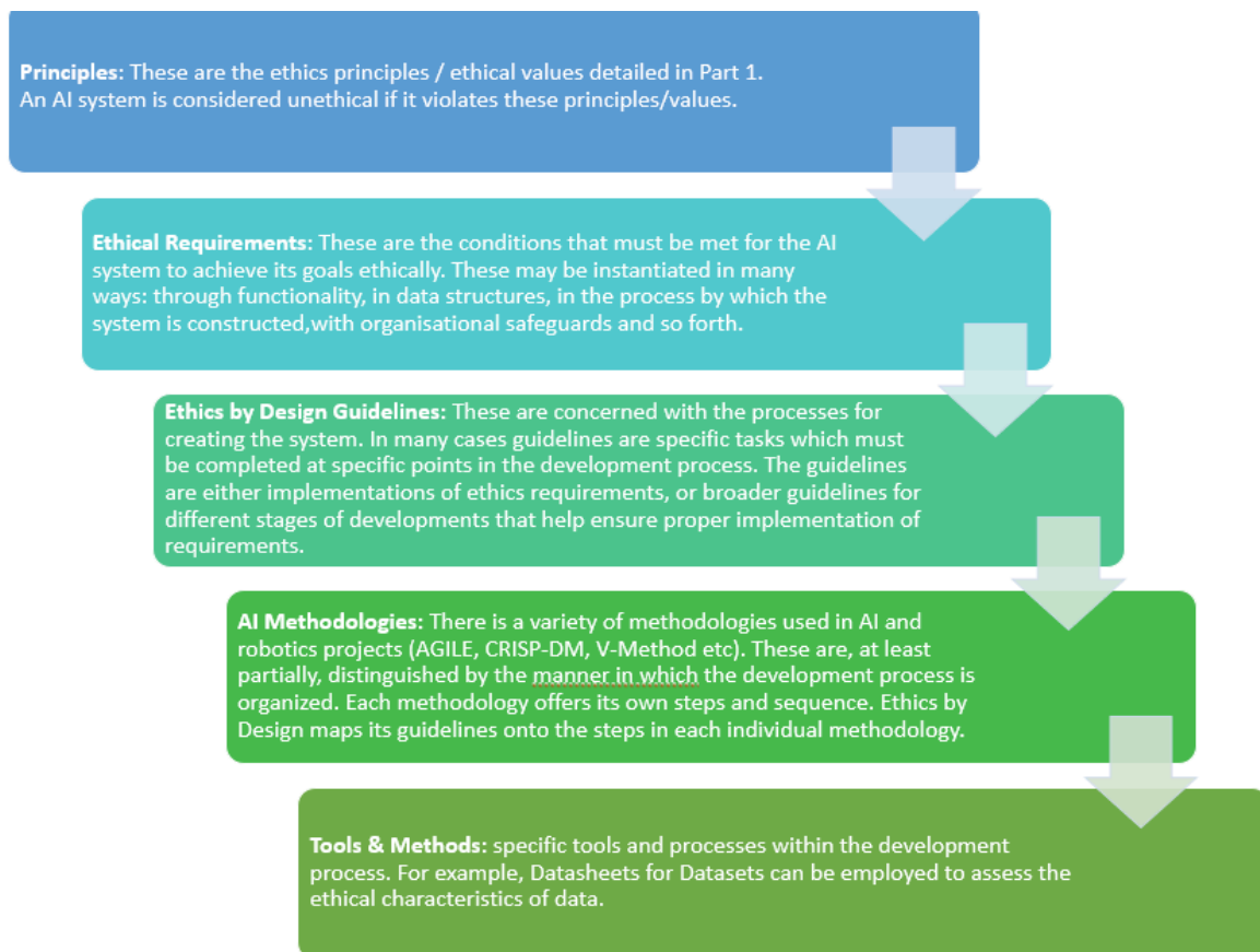
Figure 1. The 5-layered model of Ethics by Design. Taken from Dainow & Brey, 2021.

The aim of Ethics by Design is to make people think about and address potential ethics concerns, while they are developing a system [2].